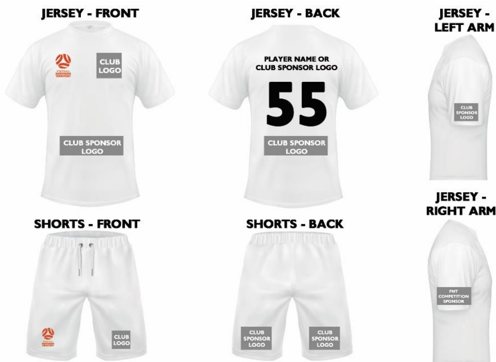
Figure: FNT Senior competitions playing strips style guide